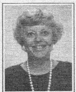
Each Office is independently ... Owned And Coersist