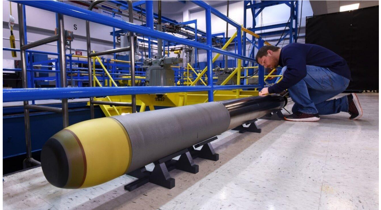
Northrop Grumman has submitted its Very Lightweight Torpedo for the Navy's Compact Rapid Attack Weapon competition, which is due to select a winner in March 2022.

WASHINGTON: The Navy is planning to award a contract in March 2022 for a new lightweight torpedo, a major milestone for the first new torpedo the service will field in over two decades.