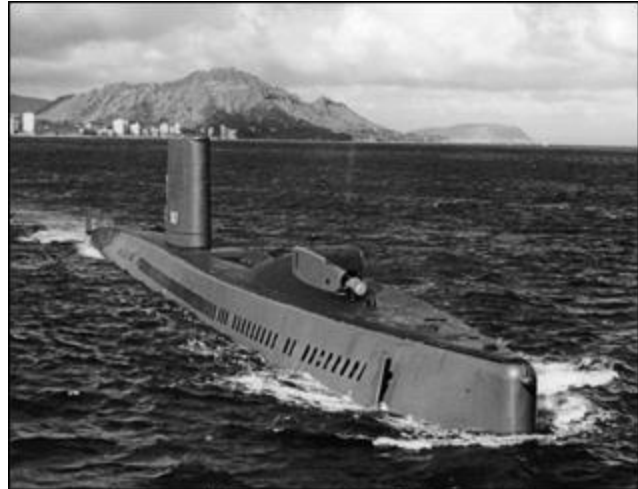
USS Halibut (SSGN/SSN-587)

In 1970, Halibut was modified to accommodate the Navy's deepwater saturation divers*. The following year, it went to sea again to participate in Ivy Bells, a secret operation to install taps on the underwater communications cables connecting the Soviet ballistic missile submarine base at Petropavlovsk on the Kamchatka Peninsula with Moscow's Pacific Fleet headquarters at Vladivostok.