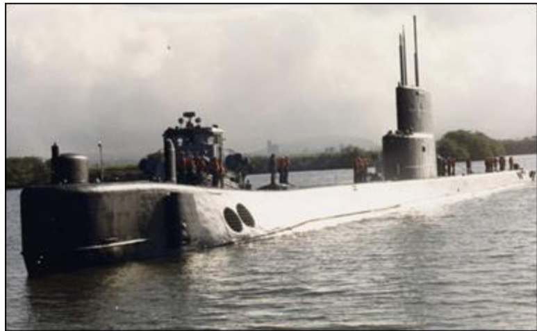
USS Seawolf (SSN-575)

USS Seawolf with the other famous special missions boat USS Halibut. At the time of this photo Operation, IVY BELLS was still a complete secret, and few observing these two boats would have realized their significance within the Cold War which was playing out at the time.