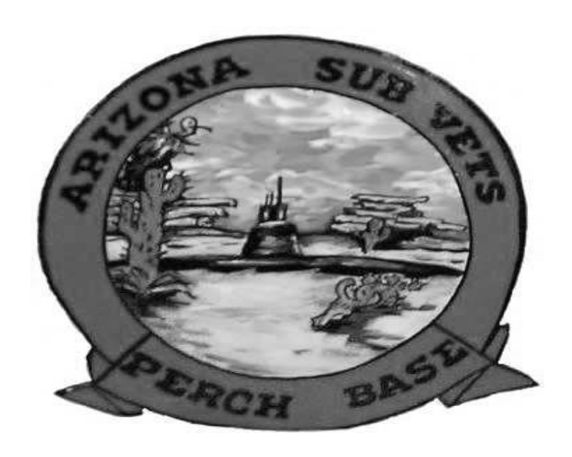
Next regular meeting - March 8, 2003