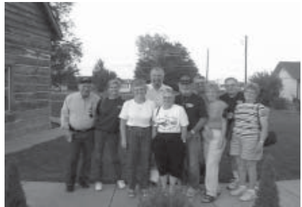
Most of the gang that came "up the hill" stayed the night and we found a great small Italian restaurant. Do we look well satisfied?